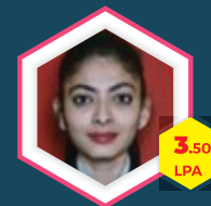
SHRUTIKA MAIND CIPLA, KURKUMBH UNIT I